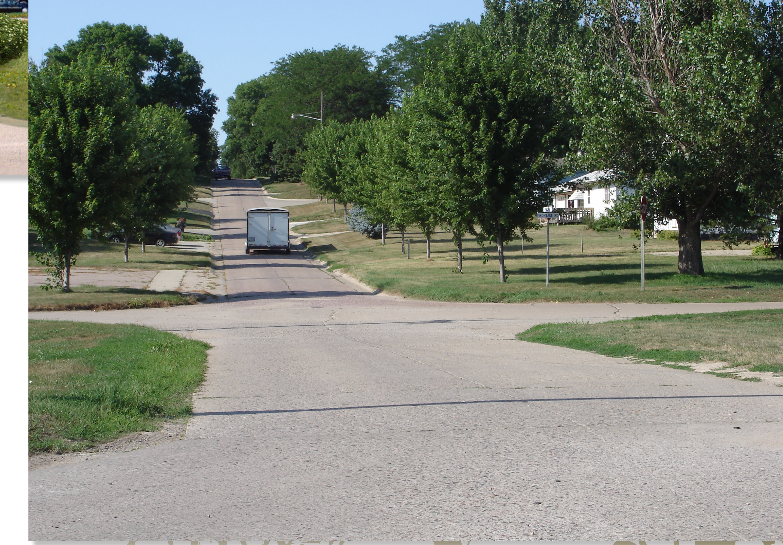
South 2nd Street corridor with street trees (2006)