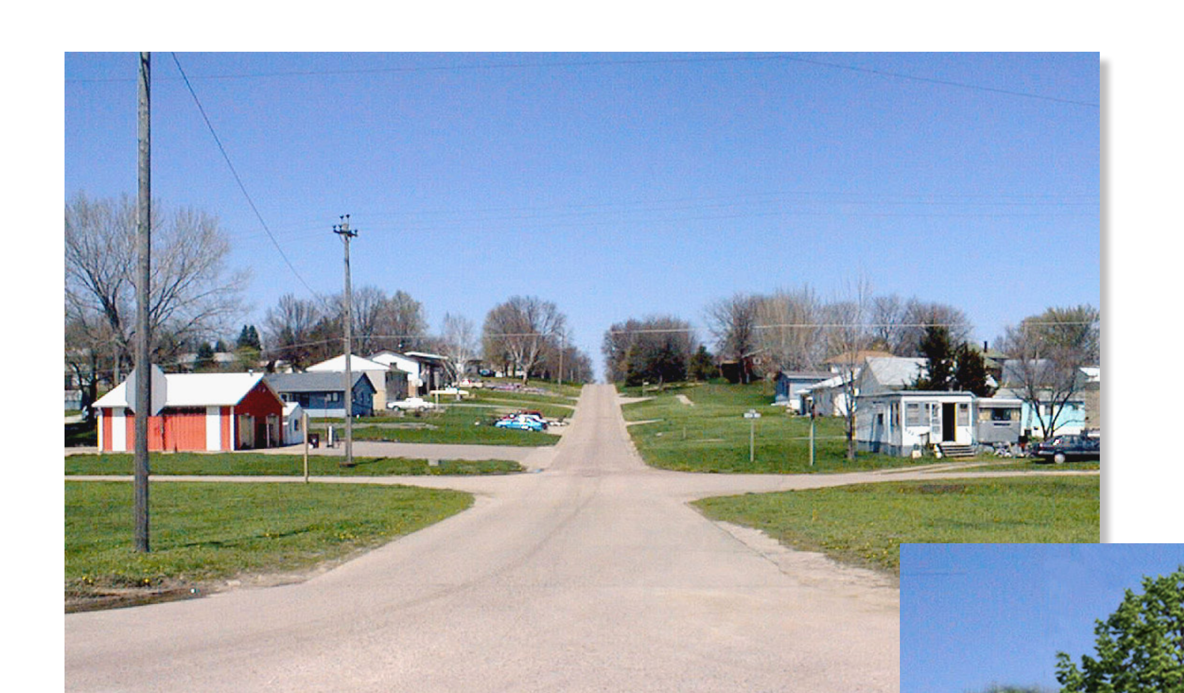
South 2nd Street facing north from Highway 20 (1999)