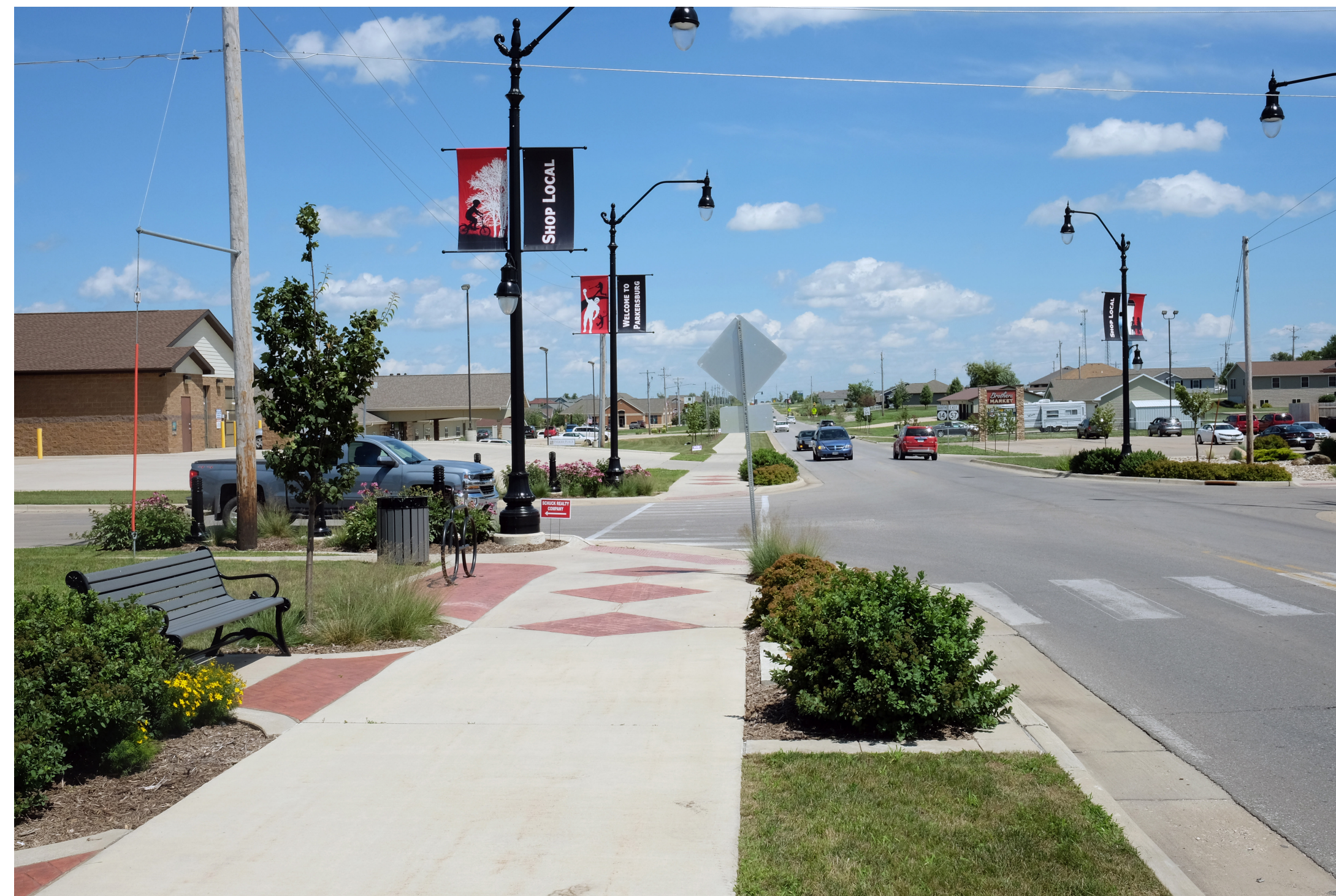
Streetscape elements include decorative lighting with banners, plantings, and curb ramps (2016)

Despite this setback, the community was not deterred, taking part again in the program in 2009, and has since implemented the proposed highway corridor design.