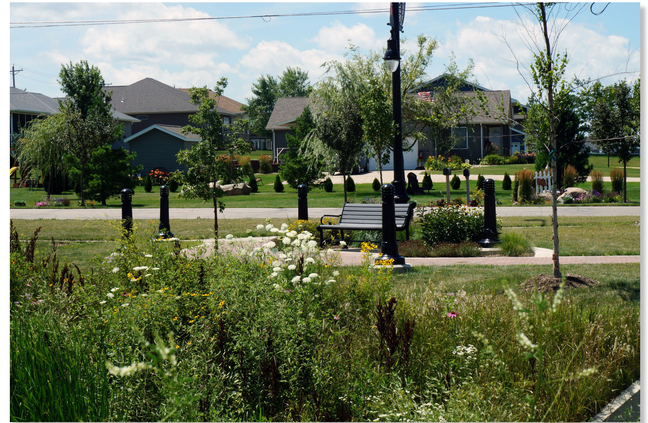
Seating and native vegetation along the pedestrian path (2016)