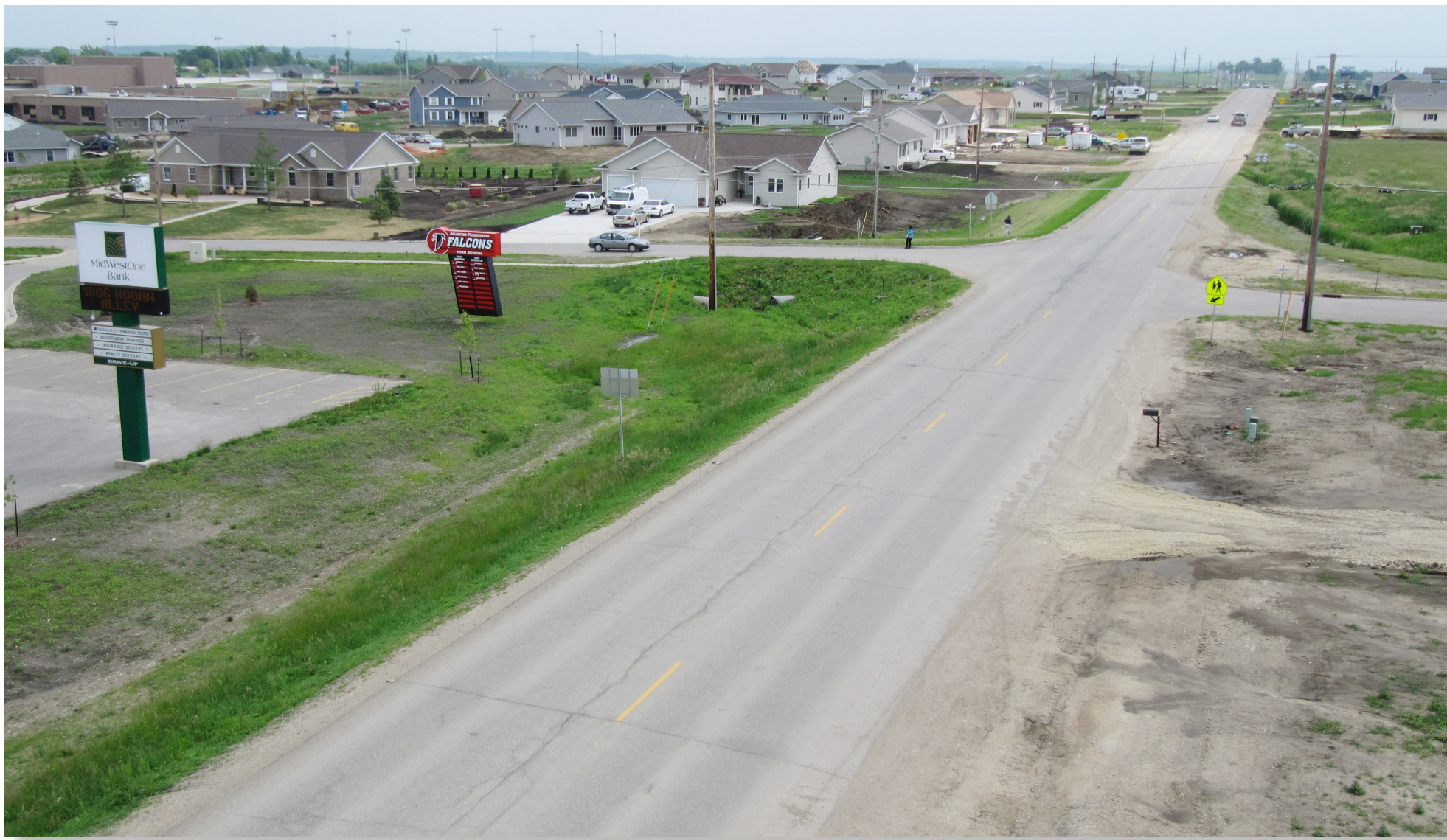
West of Highway 57/14 & Johnson Street intersection in 2009