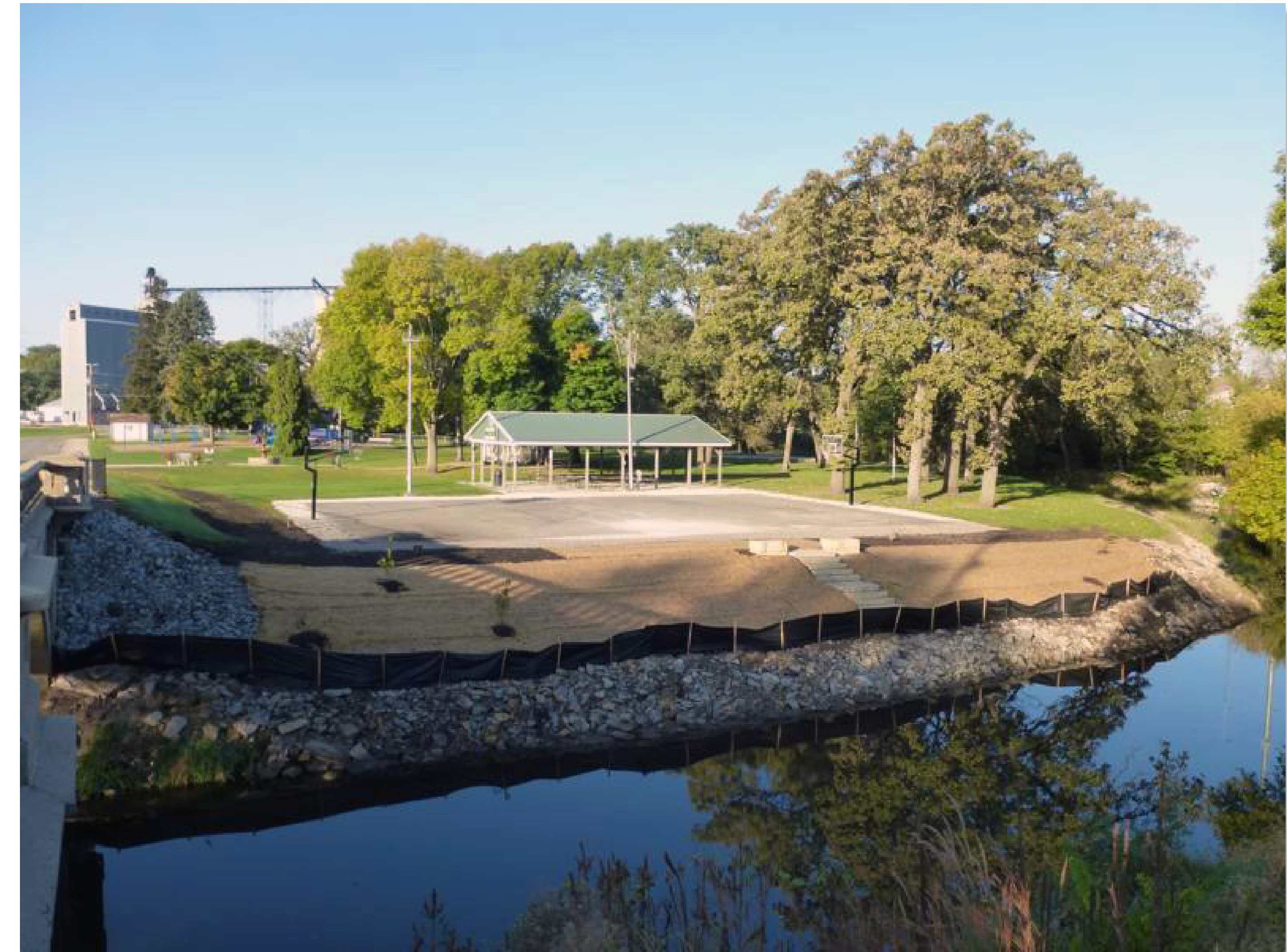
Completed streambank reconstruction, October 2014

Bear Creek is a prominent feature through the center of Shellsburg. During the Community Visioning process in 2012, the Shellsburg design team proposed strategies for stabilizing the streambank while improving the natural beauty of the creek.