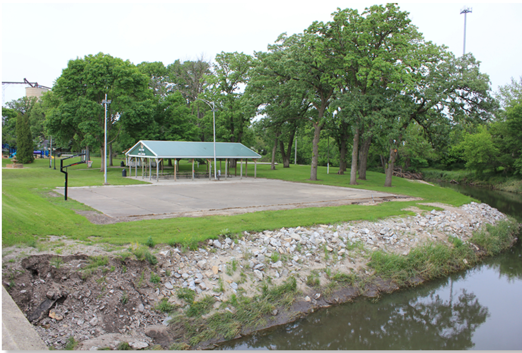
Streambank along Bear Creek in 2012