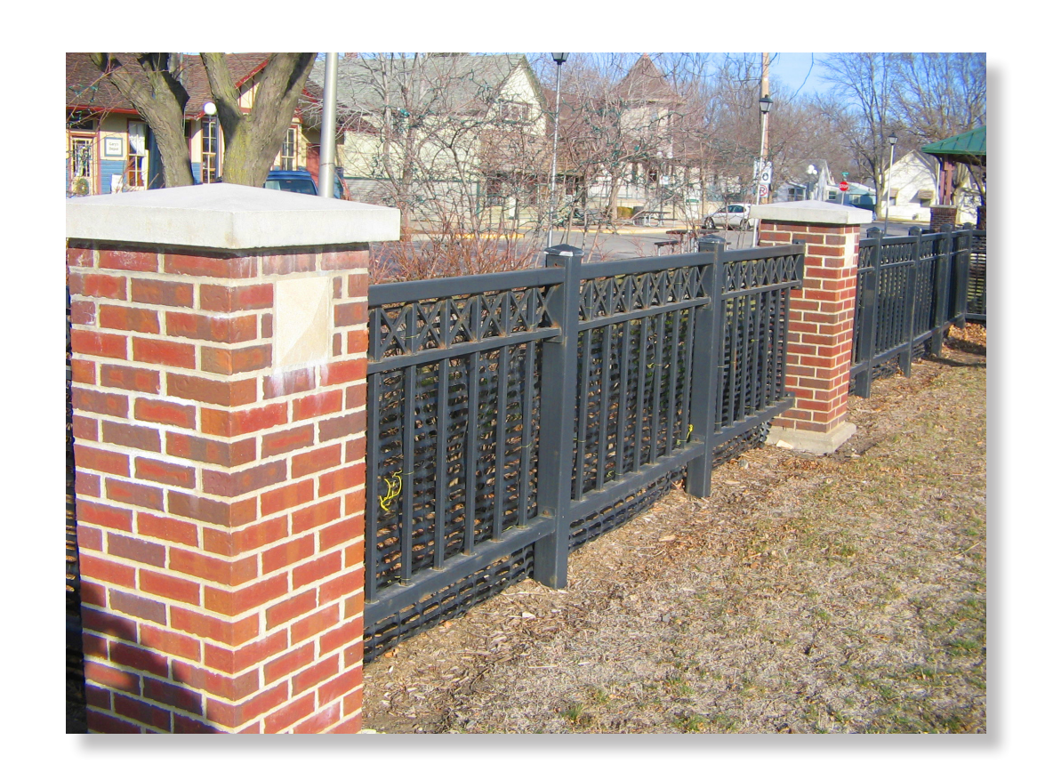
Completed fencing and brick pillars

Creston participated in the Community Visioning Program in 2000. During the goal-setting process, the visioning steering committee decided that it wanted to focus some of its efforts on generating tourism by capitalizing on Creston's railroad heritage. The visioning design team created a concept plan for the site of the old roundhouse and east along the railway corridor.