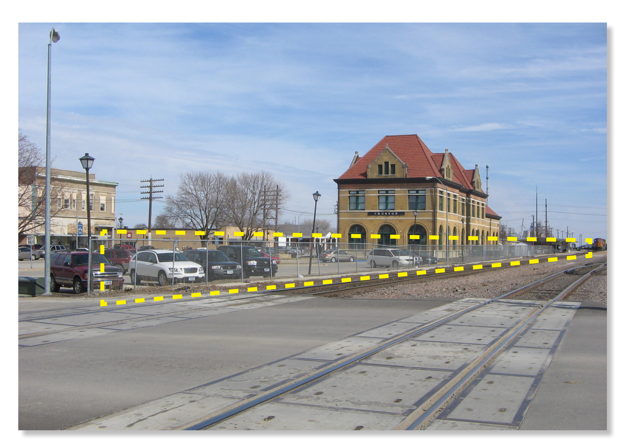
Railway corridor near city hall in 2000