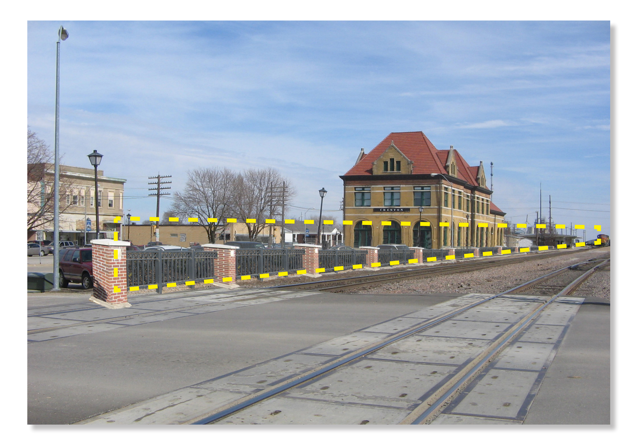
Proposed fencing and brick pillars along the railway corridor