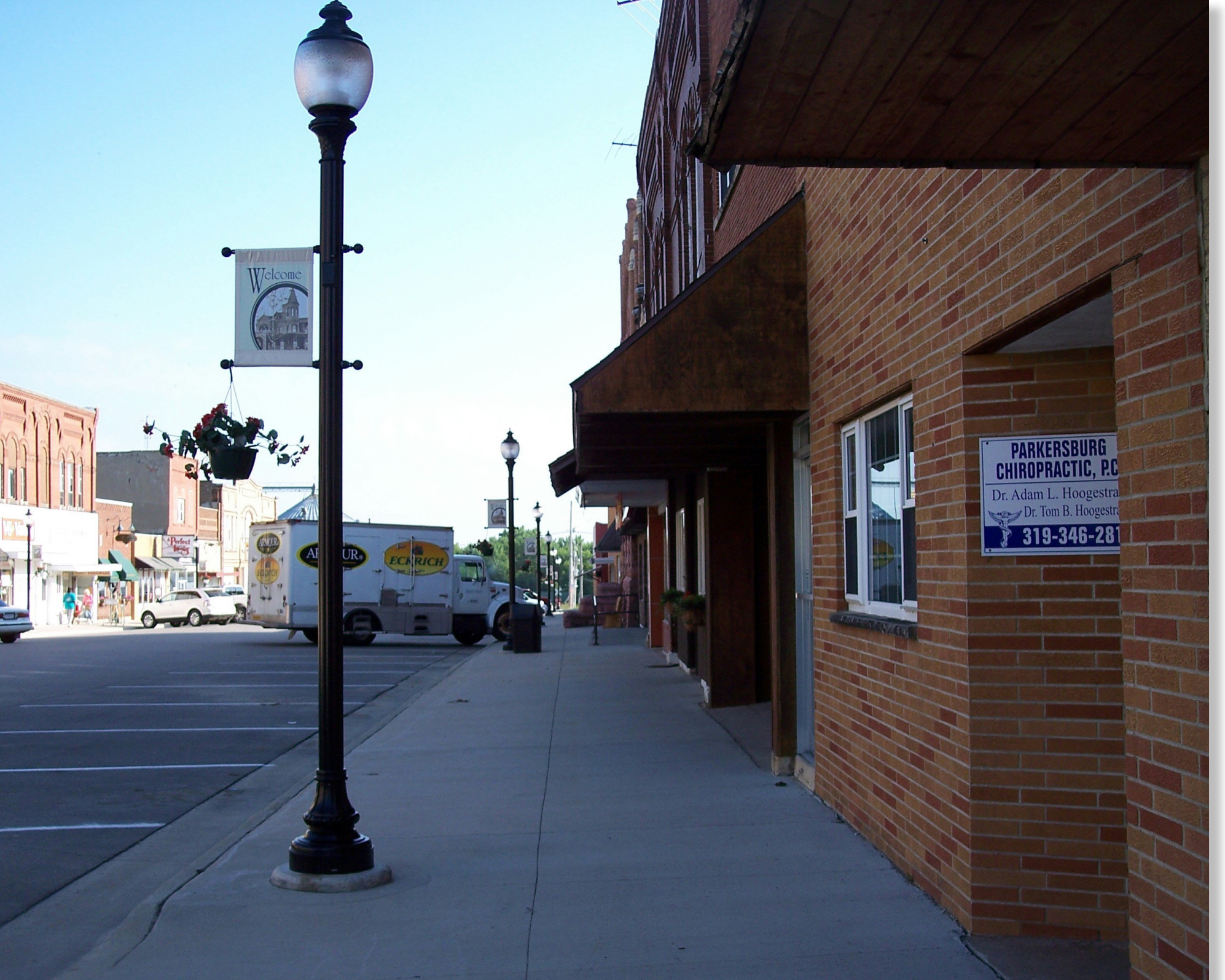
Completed downtown streetscape project (2009)