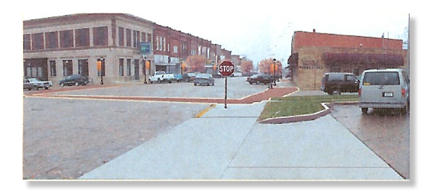
Proposed streetscape enhancements