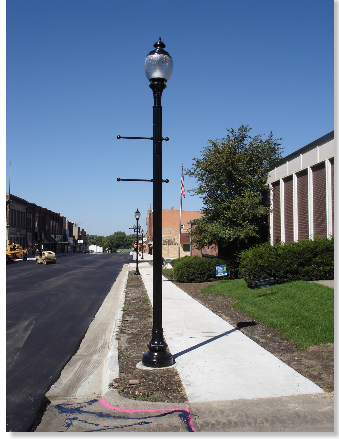
Partially implemented downtown streetscape (2006)