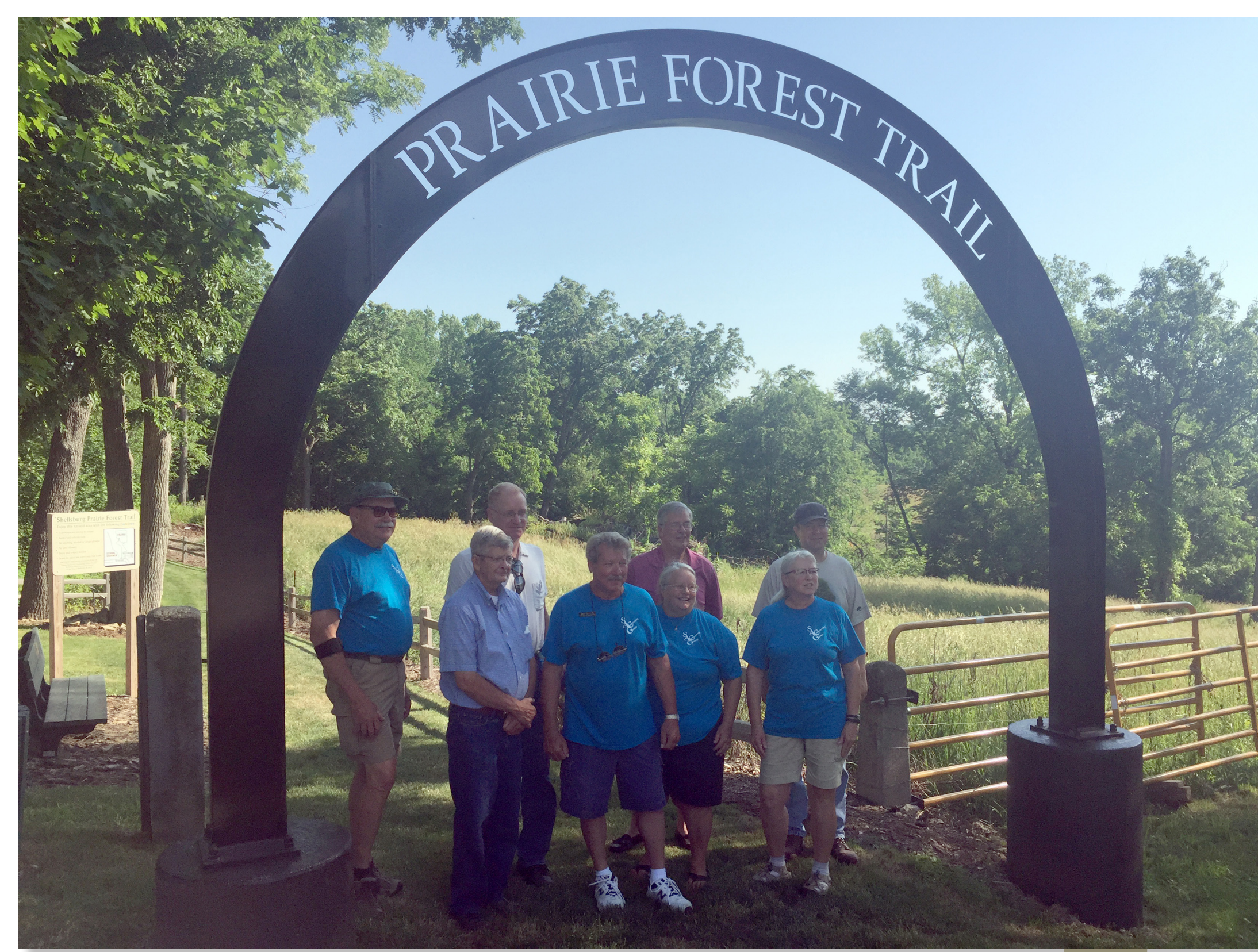
Prairie Forest Trailhead