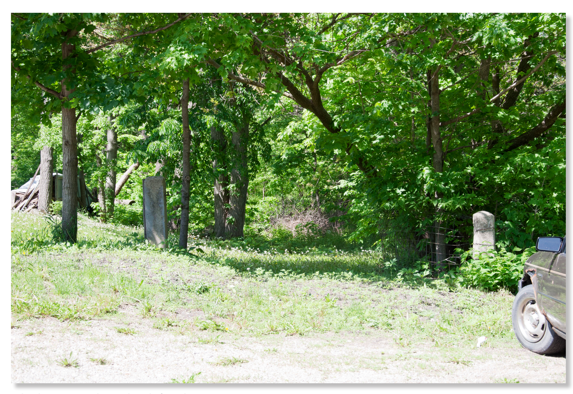
School property at the north end of Pearl Street in 2013