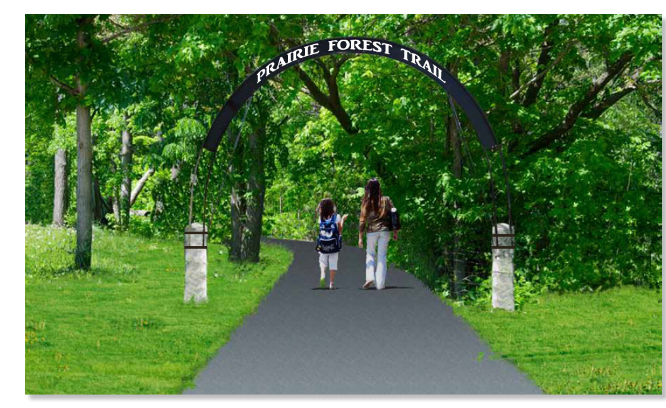
Proposed trailhead at the north end of Pearl Street