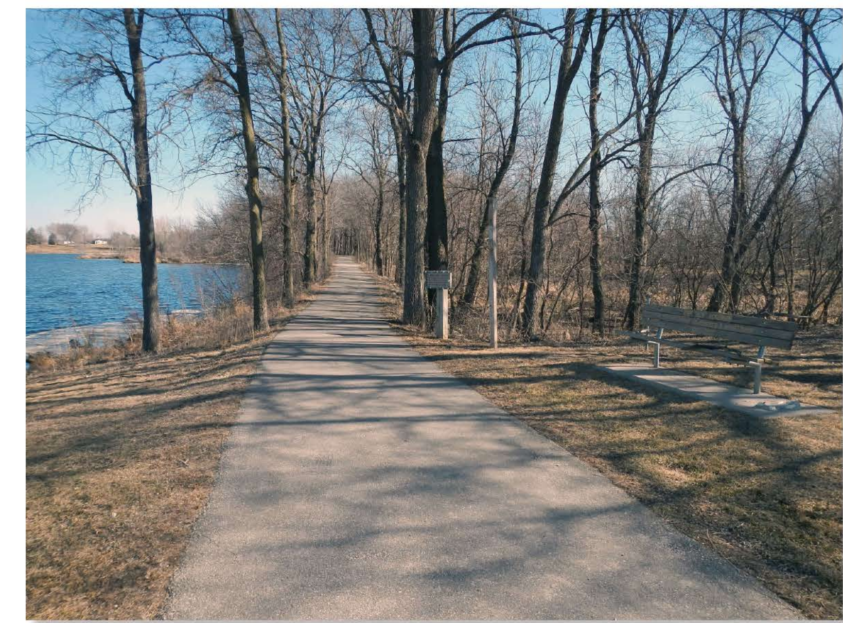
Lakeshore Park Trail

More than 85% of respondents who answered this question indicated that they visited a park during the past year. More than 30% of respondents visited a park at least once a month, and more than 20% go to parks at least three times per week.