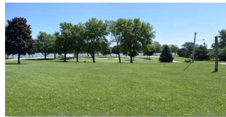
Existing Cedar View Park View