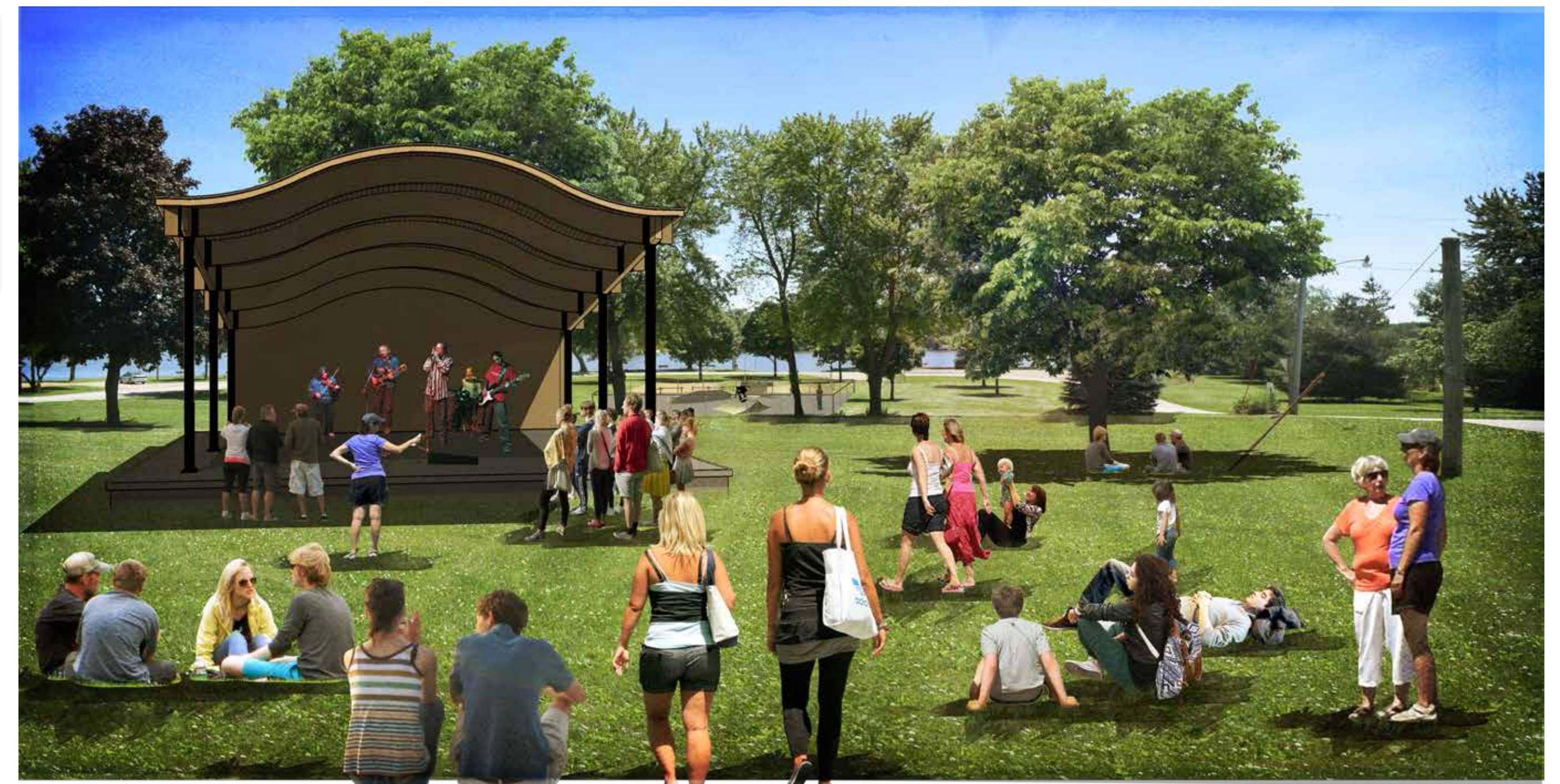
Proposed Bandshell and Relocated Skate Park in Cedar View Park