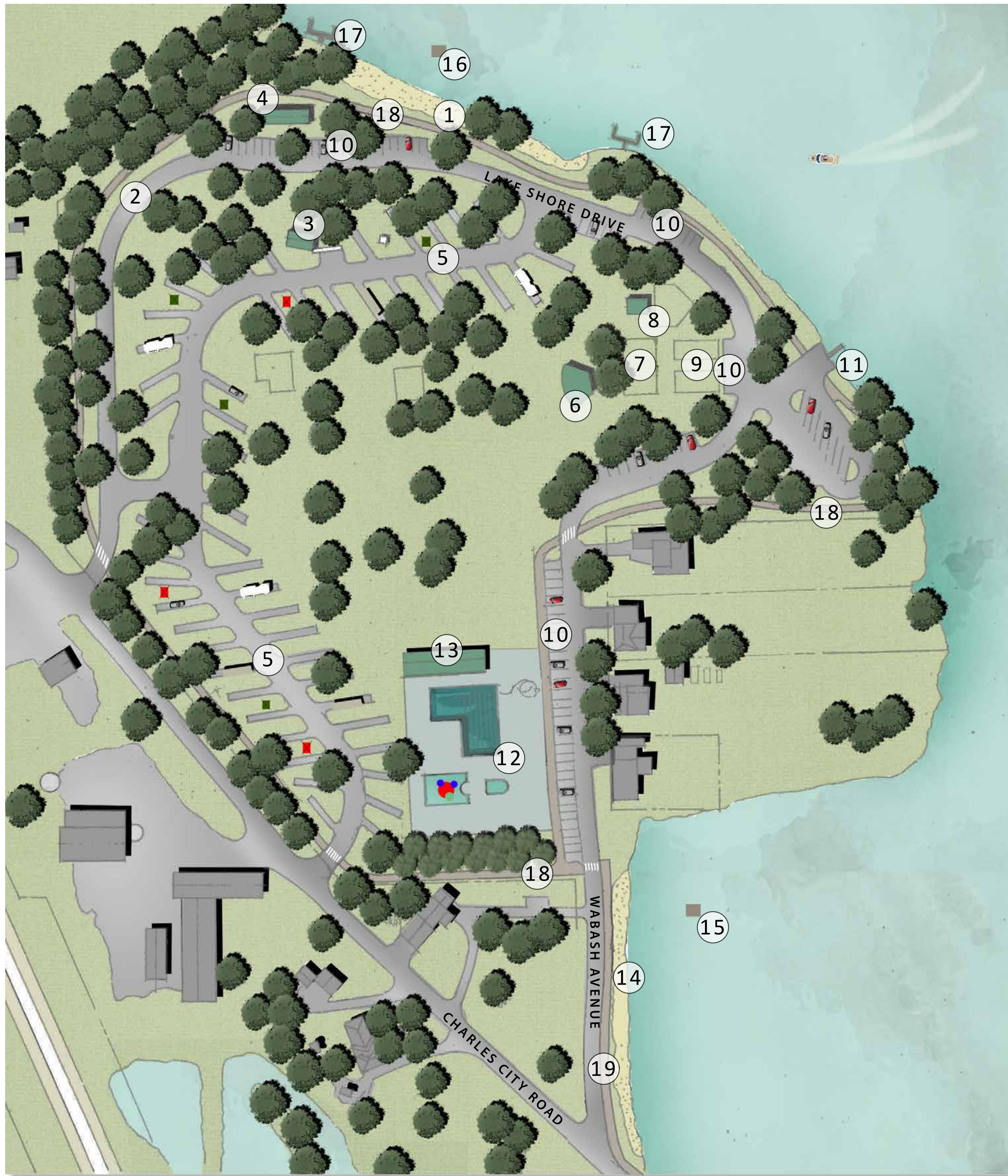
Plan Showing Proposed Enhancements