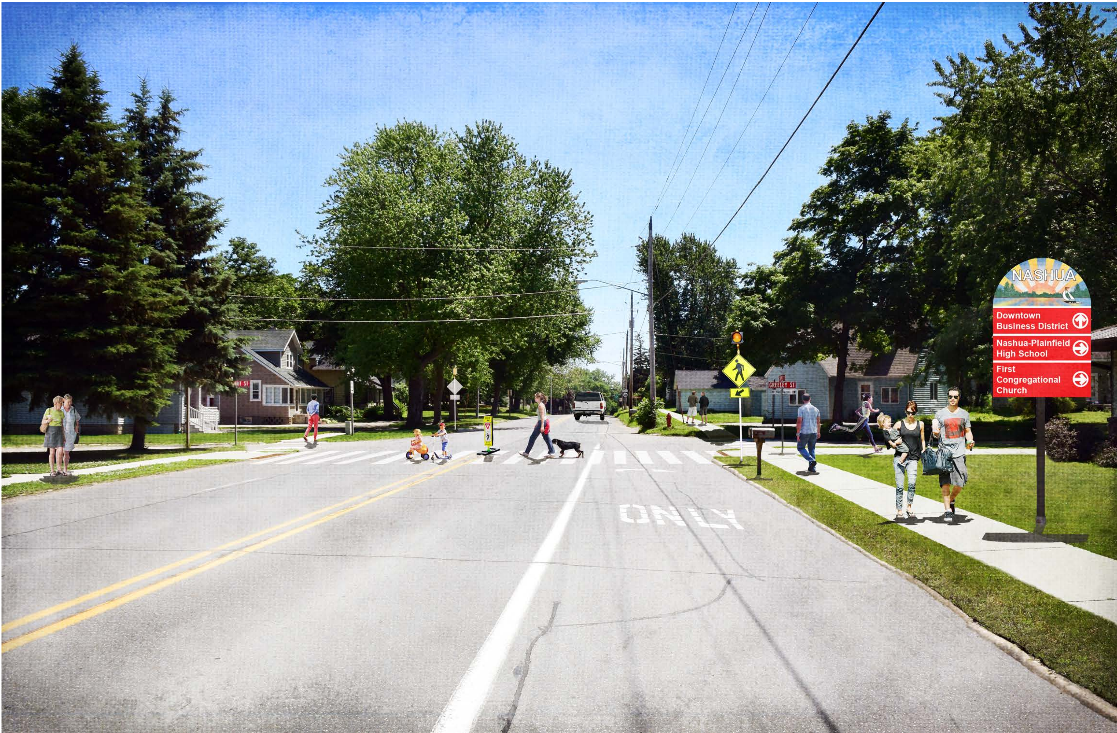
Enhancements at Intersection of Highway 346 and Greeley Street

New commercial developments near the intersection of State Highway 346 and Amherst Boulevard have no sidewalks, making access difficult and unsafe for pedestrians. A proposed sidewalk to provide safe access the Dollar General Store, Subway, and Welcome Center is shown on the plan. The property owners would also benefit from the new sidewalks and may be willing to pay for this project.